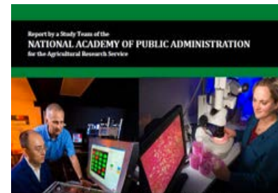
AGRICULTURAL RESEARCH SERVICE: REVIEW OF ADMINISTRATIVE AND FINANCIAL MANAGEMENT SERVICES