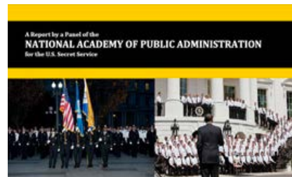
United States Secret Service: Review of Organizational Change Efforts

Organizational assessments and strategy development Implementation support Strategic plans and performance measures Stakeholder outreach and collaboration services